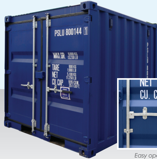
Easy opening doors