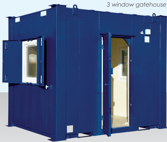
3 window gatehouse