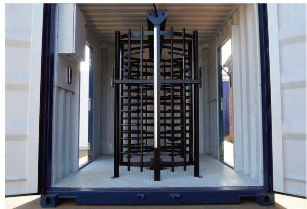
Double turnstile interior